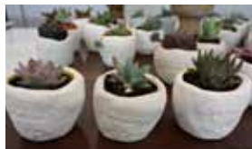
Ceramic succulent pots

decided it was high time for us to recognize our members along with others who have volunteered their time every week as tutors and in the library at Oakland's Burckhalter Elementary School. For the past 23 years, these volunteers ( group photo above ) have been making a profound difference in the lives of children who otherwise would not have had the additional help they needed in basic academic skills.