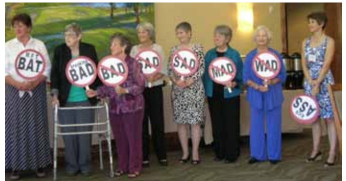
As the incoming Executive Board was installed, they were warned of possible "disorders" associated with each of the positions.