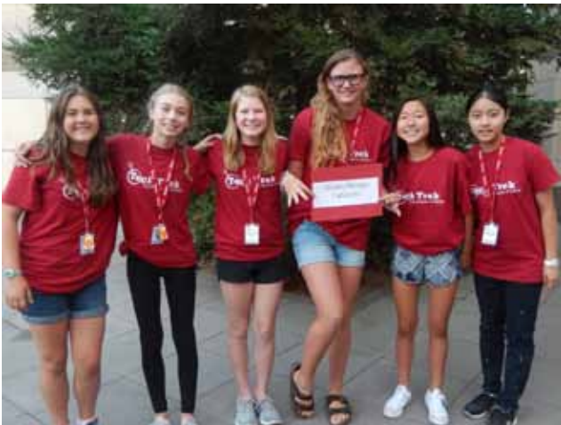
The 2016 Tech Trekkers

The girls and the parents gave many thanks for this special experience for their girls. I heard the words “life-changing experience” from more than one parent. Everyone was having such a good time chatting that we finally had to kick them out at 8:45!