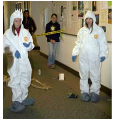
FBI Crime Scene 8: Two participants got to wear HAZMAT suits to investigate a crime scene with FBI agents.