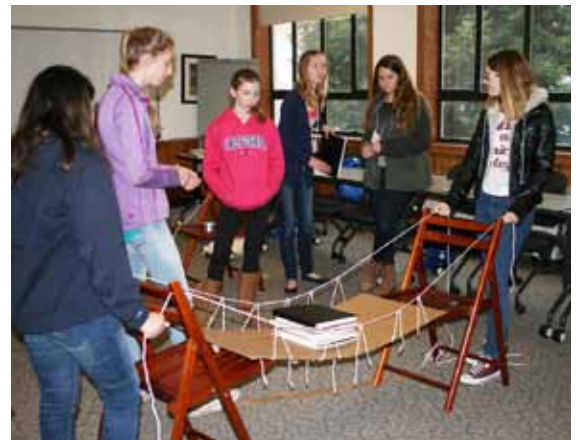
Building Bridges: Girls tested their engineering knowledge by seeing how much weight their suspension bridges could support.