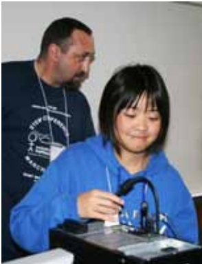
Hands-On Computers 2: Girls took apart and reassembled real computers.

One hundred twenty-five middle school girls, 40 parents, and a host of AAUW-OML and Rotary volunteers, former Tech-Trekkers, and Saint Mary's College students spent Saturday, March 19 learning about STEM (Science, Technology, Engineering and Math) at Saint Mary's College.