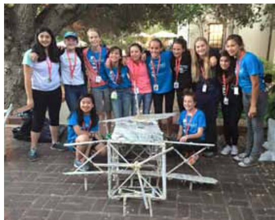
(photo above) “Build It Airplane” from Camp Curie was pretty intricate – Four of the seven campers from OML were in the dorm group that built this bi-plane. It won the award for best “structure”.

The girls experienced the joy and newness of being with a lot of other smart girls and worked with hands-on projects in several STEM areas. They had many opportunities to be creative – especially at the week’s end “build it” night. They learned a lot of science, of course, plus what living on a campus is like and how to make new friends. This year, core classes in coding and cyber sleuthing were added to the long list of other engaging and cool science projects due to generous donations that funded new computers. Both camps were a big success, as usual.