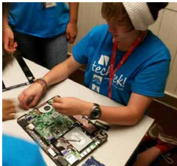
(above) Taking a computer apart – a first time project this summer