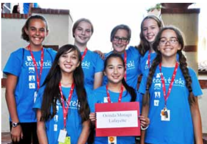
(above) The seven girls our branch sent to Summer Camp (below) Results from a Mouse Trap Car project