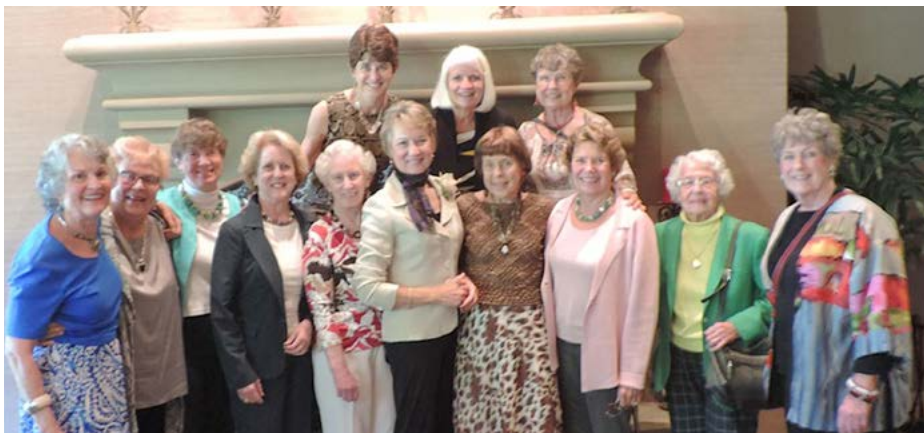
Previous years' Distinguished Women who attended the luncheon.