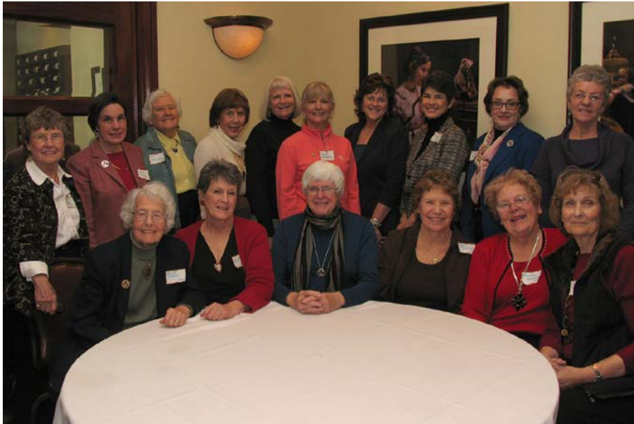
A lively group of past AAUW-OML presidents convened at Uncle Yu's in Lafayette on February 12.