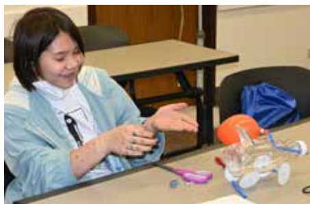
The Balloon Car Challenge Workshop

The workshops were interesting and engaging. They loved the Get to Know Your Brain workshop, during which the girls learned about the basic brain structures and functions. They dissected a sheep brain