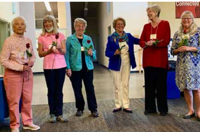
Here are our newly elected officers, who all said, "I can do something."

I am only one; But still I am one. I cannot do everything, But still I can do something I will not refuse to do the something I can do.