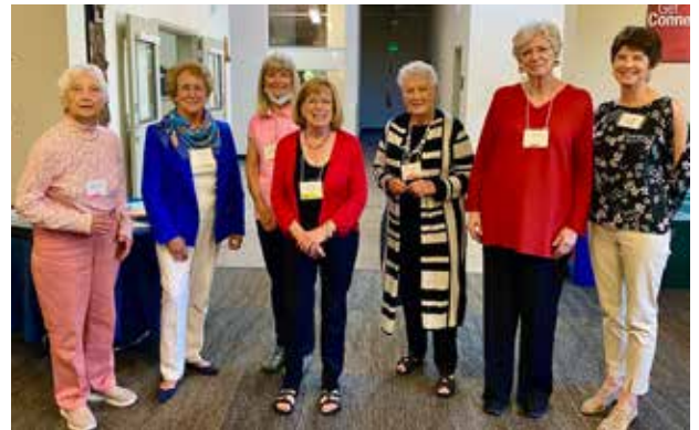
(above) The outgoing board of directors