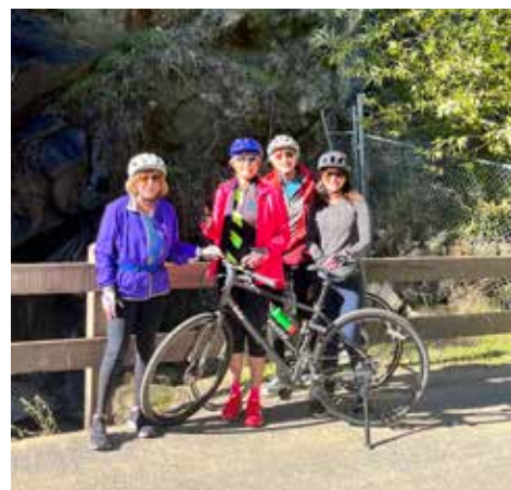
January 26 proved to be a beautiful day for the bike riders!