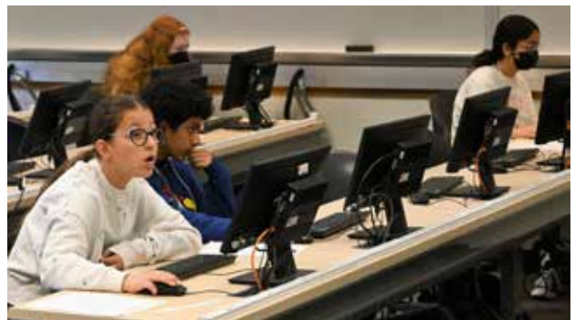
(at right) 3-D modeling with Tinkercad.