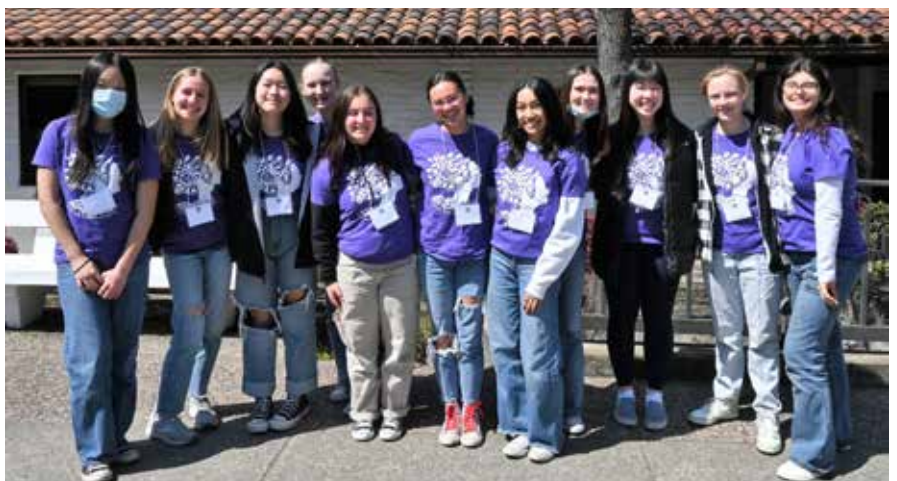
(bottom) Our 2023 high school ambassadors!