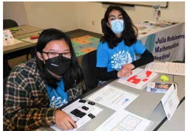
(left) Putting together a beehive. (right) Fun with Math workshop.