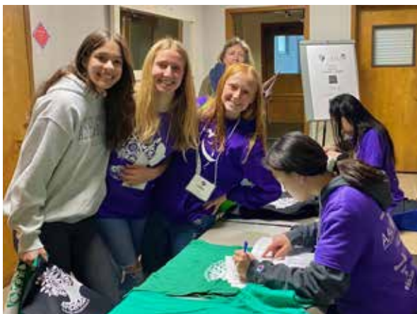
(above) High school ambassadors in training for the day of the conference. At right, OML members and volunteers prepare for the big day.