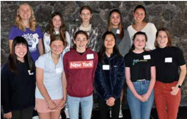
2023 Tech Trek Campers, and their STEM Ambassador Sisters, gathered at the ice cream social.

After four years with no Tech Trek camps held at Stanford University, our Lamorinda seventh graders are headed to a residential STEM camp at Sonoma State University in July. The Tech Trek committee invited the 2023 girls and parents to meet in May for a casual ice cream social in the Miramonte Gardens clubhouse.