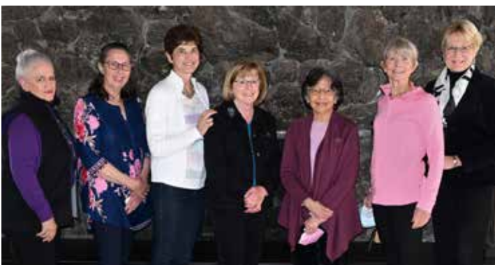
AAUW-OML Tech Trek committee members welcomed 2023 Tech Trek campers and their parents to the social.

The social ended with the girls gathered in front of the fireplace for photos, as Trekkers past and present continue their TT journeys. Since 1998, AAUW-OML has selected 129 local STEM girls to attend Tech Trek science camps, thanks to the generous, loyal support of members like you. We thank you.