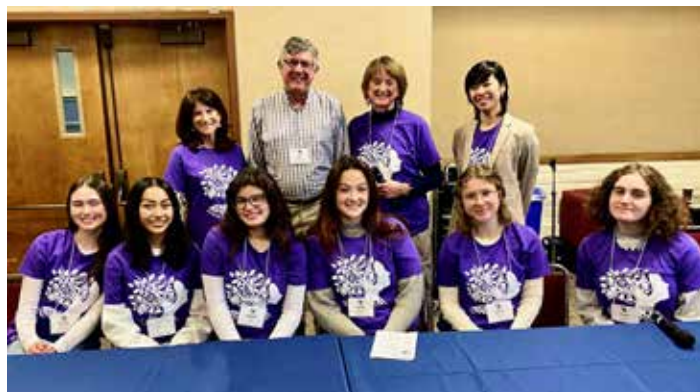
Student panel and speakers

One parent wrote: "When you know better, you can do better. . . I loved that the parent workshop highlighted topics/areas I can now actively address with my children. In all areas of their lives curiosity, resilience, and connection."