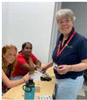
That's me, showing Tech Trekkers how solder while making a flashlight.