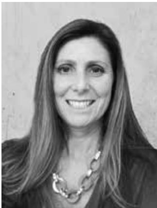
Read more about Teli on page 3.