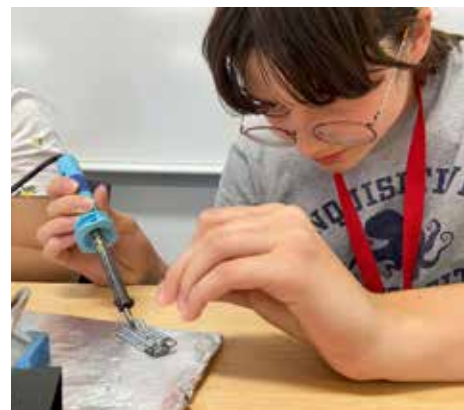
Soldering close-up at Tech Trek Camp last summer.