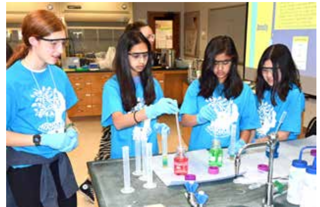
(photo above) The Cool Chemistry Workshop (below) Ambassadors show off the girls' T-shirts.