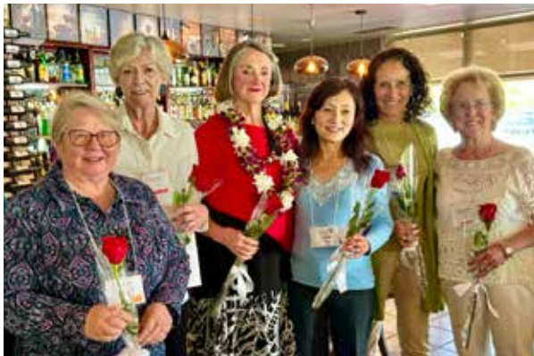
Incoming board members at the May Luncheon

At this meeting, we will approve all financial reports, complete any end of the year items and discuss the AAUW National required bylaws revision. We will also approve the 2024-25 calendar, discuss the budget and planning process and review the 2024 fundraiser. All incoming and outgoing VP's and chairs of branch priorities will have a short, break-out time to discuss their respective jobs.