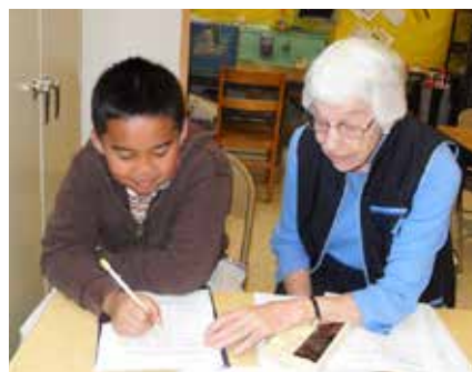
Some photo memories from the Burckhalter days