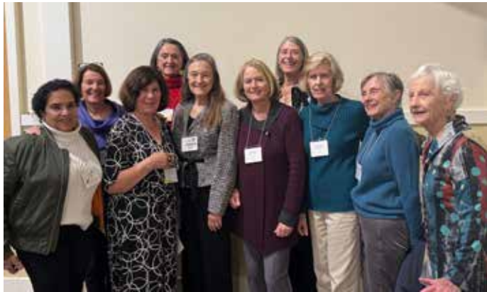
The 2025 Scholarship Committee.

Sunday, April 27th was a special day as we honored seven young women as they inspired us with their extremely busy lives and all their accomplishments. They shared their passions and inspired us. They gave us hope for the future. Our scholarship committee read applications, evaluated them and then interviewed them. We were impressed with how well they all interviewed. Then we had the hard decision of selecting the recipients.