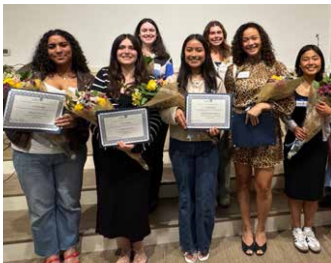
High School and Saint Mary's College Scholarship winners. The young women holding the certificates are our college awardees.

As you can see it's another group of inspiring, successful young women. It was inspiring to meet and hear about all their accomplishments. Thank you to all that help and supported these students. We wish them well in their journey.