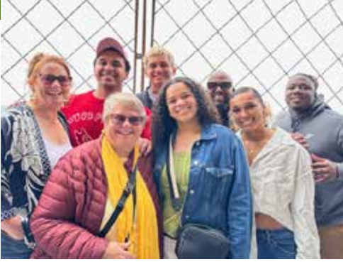
Here I am with my family at the top of the Eiffel Tower on a trip to Paris back in June.

community outreach projects recommend their budgets, the Board of Directors meet on it and ultimately approve budgets that we take to the full membership for a vote in September.