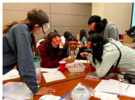
Forensics with safety glasses: girls in Forensics core class identifying unknown substances.

On the field trip to the Valley Wastewater Recycling Plant we learned how household effluent water is processed to make water clean enough to drink – and they handed out bottles for us to try! A lecture on thermodynamics preceded making ice cream.