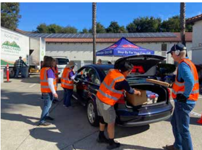
(Photo above) Taken at one of our past Shred Days– we are there to help you!

Thank you for your support. Send questions to: lanasan@aol.com