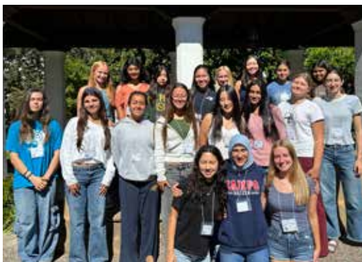
Our 19 High School Ambassadors

We have 19 eager high school Ambassadors from eight local high schools working to plan our conference. During our first meeting we spent time getting to know each other. We also introduced the committee groups and got their choices in terms of which group they would like to help. In our Ambassador meetings, we are highlighting famous STEM Women in History as well as current news about women in STEM.